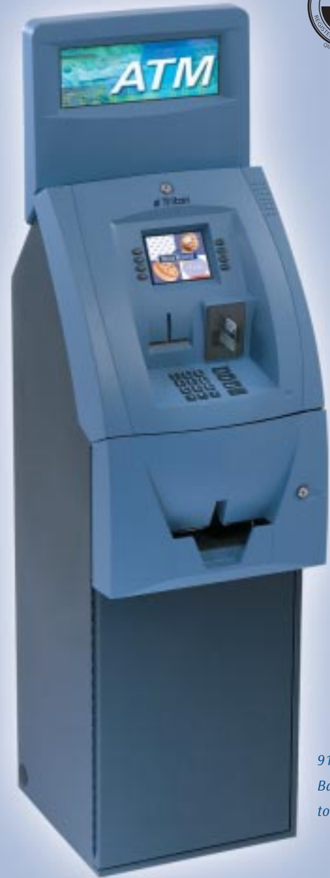
9100 with Backlit topper